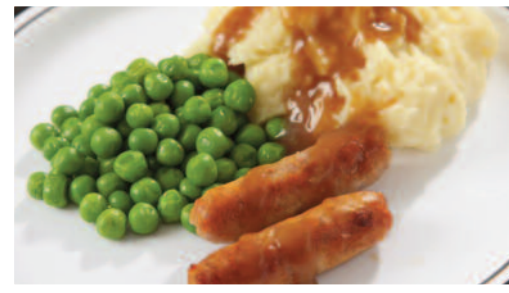
Sausages served with Mashed Potato, Seasonal Vegetables & Gravy