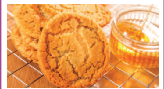
Golden Crunch Cookie

AVAILABLE EVERY DAY – UNLIMITED SALAD, FRESHLY BAKED BREAD, FRUIT YOGHURT & FRESH FRUIT PLATTER. FOR ALLERGEN INFORMATION, PLEASE ASK ONE OF OUR CATERING TEAM. ALL THE ABOVE DISHES ARE SUBJECT TO AVAILABILITY.