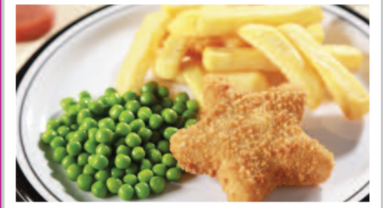
Fish Star (MSC) served with Chips & Peas or Baked Beans

VEGETARIAN VERSIONS OF THE ABOVE MEAL AVAILABLE DAILY