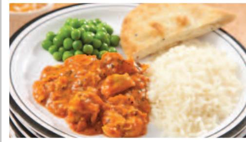
Chicken Tikka Masala served with Rice, Naan Bread & Seasonal Vegetables