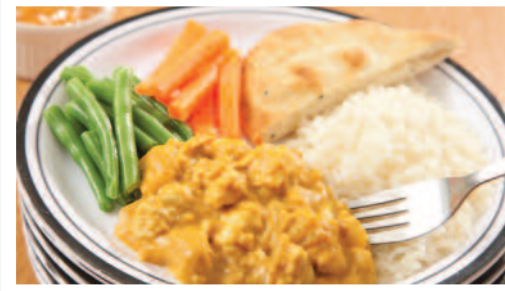
Chicken Korma served with Rice, Naan Bread & Seasonal Vegetables