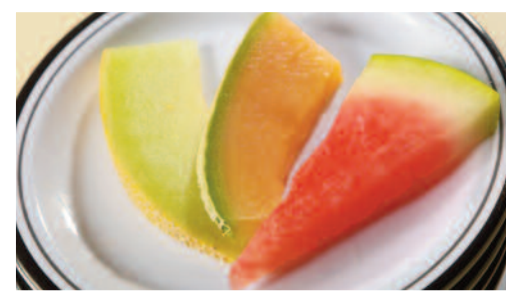
Trio of Melon