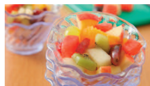
Fresh Fruit Salad