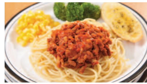
Spaghetti Bolognese (V) served with Garlic Bread & Seasonal Vegetables