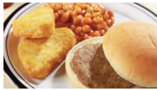
Sausage Pattie in a Bun, Hash Browns and Baked Beans