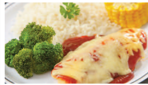
BBQ Chicken served with Savoury Rice and Seasonal Vegetables