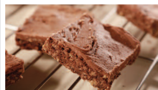
Iced Chocolate Oaty Square