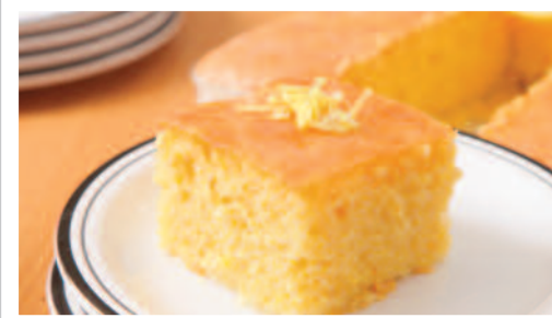
Lemon Drizzle Cake