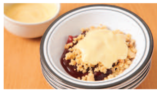
Fruit Crumble & Custard