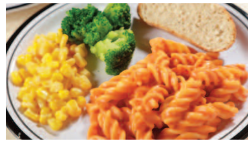
Tomato & Mascarpone Cheese Pasta served with Garlic & Herb Bread and Seasonal Vegetables