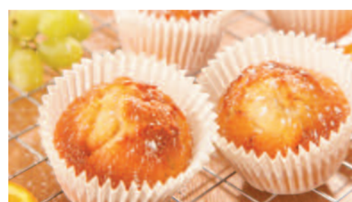
Apple & Cinnamon Muffin