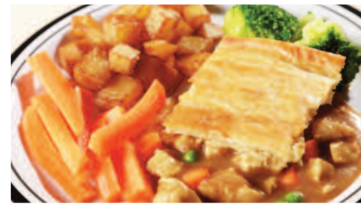
Homemade Chicken Pie served with Diced Crispy Potatoes & Seasonal Vegetables