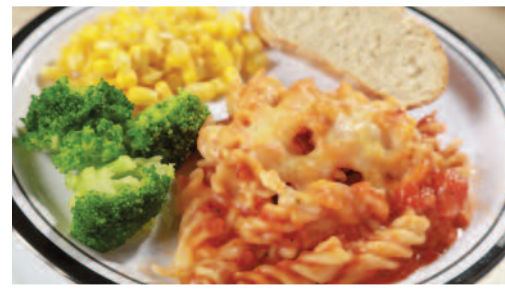
Cheese & Tomato Pasta served with Garlic & Herb Bread and Seasonal Vegetables